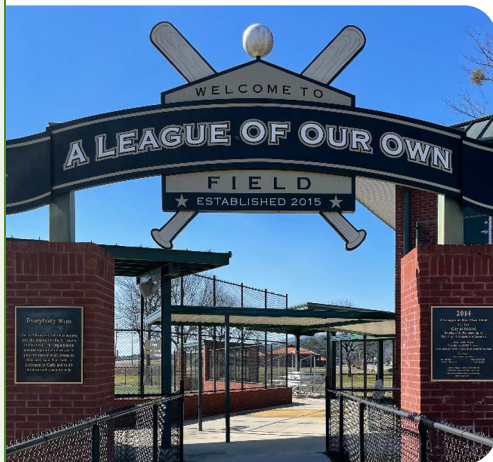
Above: The baseball park in Oxford, Alabama

Please keep checking our website ( www.rainbowomega.org ) and Facebook page for updates over the next few months. Ω